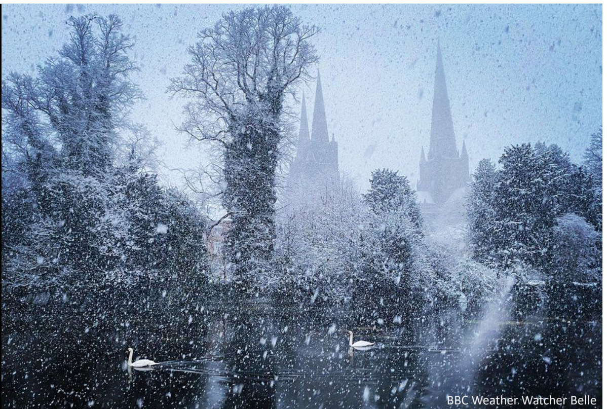
A snowy day two weeks ago in Lichfield, Staffordshire.